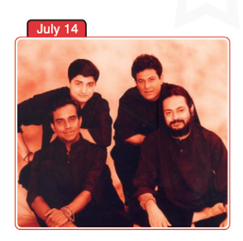
Indian Ocean Concert